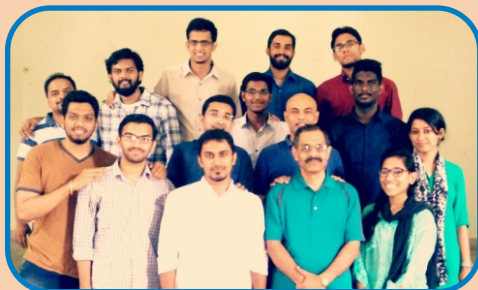
The 4th MCYM Resource Team Session - Pune