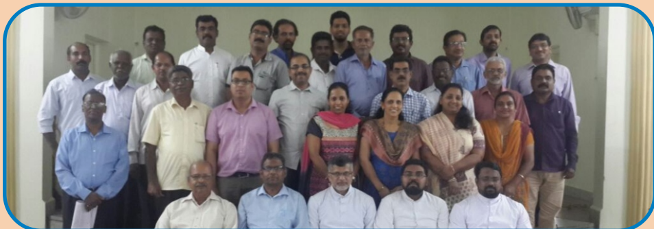
Parish Council Meet - Pune District