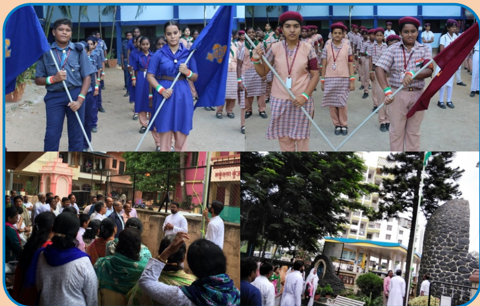
Independence Day at Vishrathwadi, Warje Malwadi and SHSS - Chennai