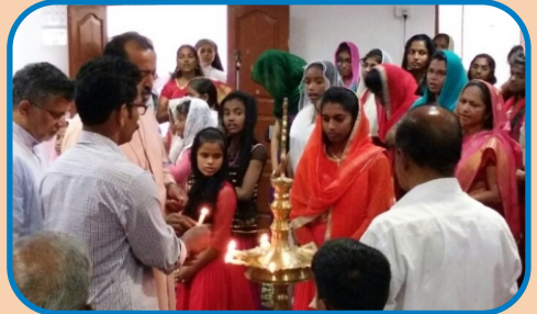
MIPL Inauguration, Hyderabad