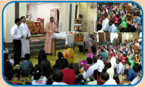
Retreat at St Mary's MSCC Warje Malwadi