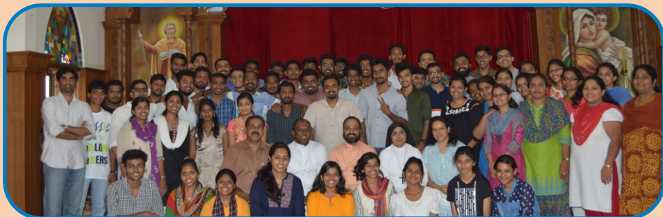
'Patmos' - Bangalore District MCYM Retreat