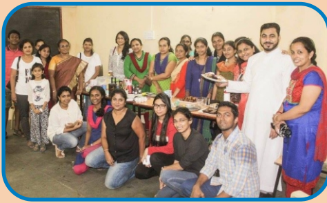
Charity Baking Workshop, MCYM Sakinaka