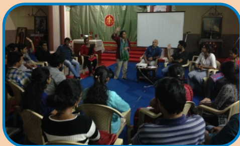
MCYM Resource Team Formation Bangalore & Mumbai