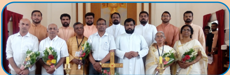
The Suvisheshasangham Members from the District Felicitated on Mar Ivanios Day Celebration in Pune