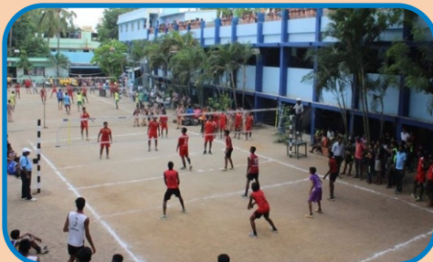
Mar Ivanios Memorial Volleyball Tournament, SHSS - Padi