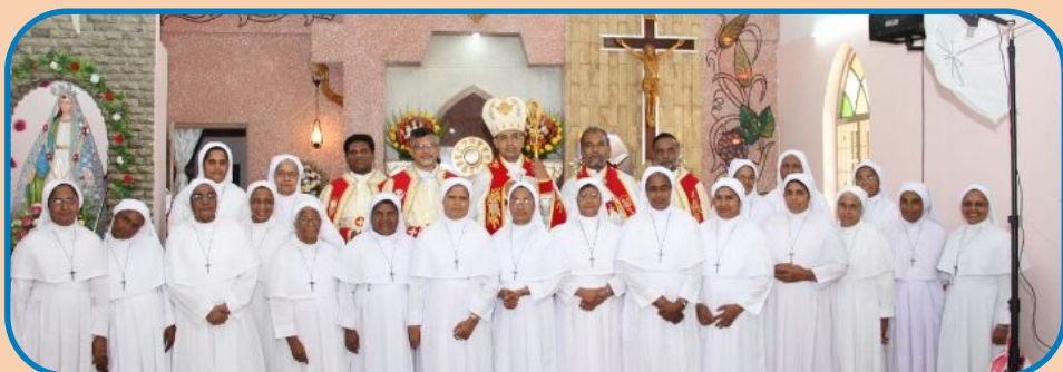
The elevation of the DM Amala Vice-Province to the status of a province, Wardha