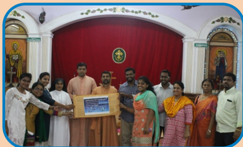
Agenda Inauguration MCYM Mumbai District