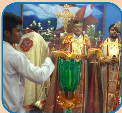
Festal Holy Qurbano at Hyderabad