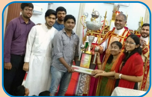
The Sakinaka MCYM receives the Y'Zest trophy