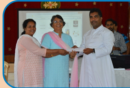
IVANIA Quiz Competition - Chennai