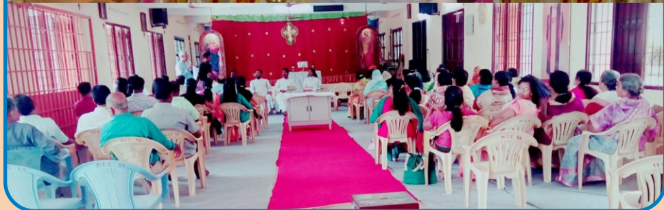
The Inauguration of Prabodhanam by the MCA & Mathrusangham in Bangalore & Chennai