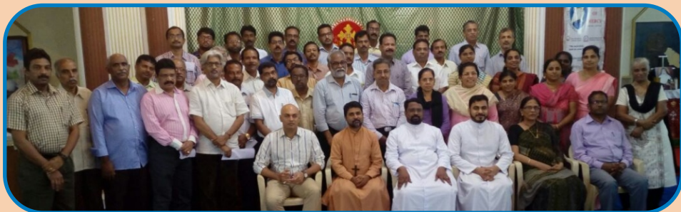
Parish Council Meet - Mumbai District